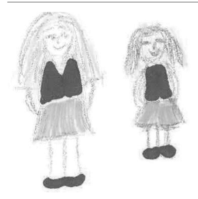
FIGURE 3 Tina's daughters – Chantelle and Louise

(Banks, 2001). The practice of creating visual data, then, presented an opportunity for Tina to transcend the visible and actual physical difference by distorting generalities of alignment. My singular interpretation was still veiled by a web of taken for granted meanings but the combination of Tina's creativity and explanation contributed to a more nuanced understanding for both the researcher and the researched.