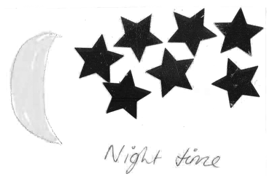
FIGURE 1 The night sky

The participants' visual data provided an opportunity to observe unseen or forgotten elements of the physical environment such as Tina's representation of the night.